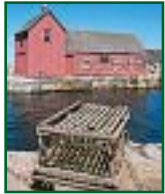
Motif #1, Rockport