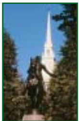
The Freedom Trail