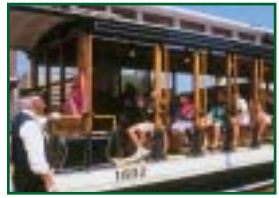
Lowell Historic Trolley