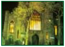
Salem Witch Museum