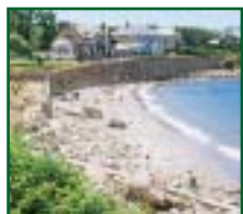
Sandy Beaches & Scenic Coastlines